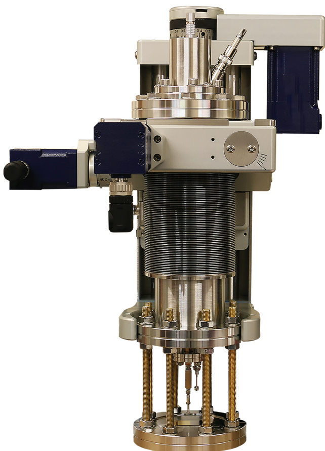
Ultra-high Vacuum Scanning Kelvin Probe (UHVSKP2020)