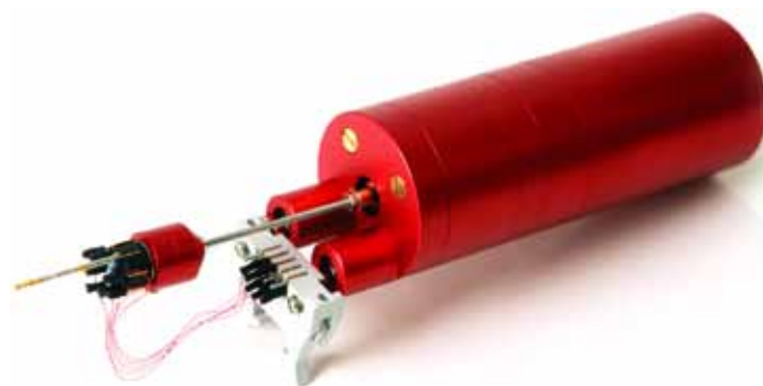
The KP Technology Kelvin Probe