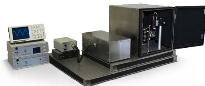
Figure 1. KP Technology SPS030 System.

The surface photovoltage (SPV) method is a well-established technique for the characterisation of semiconductors, which provides both optical and transport properties of different regions in the material under study, with high sensitivity to defect states in the sample at its surface, bulk, or any buried interface. The detected SPV response depends on the light absorption, charge separation, and charge transport properties of the system under investigation. A Kelvin probe (KP), as the first elaborate equipment for SPV detection, measures the surface work function and follows the change in the surface potential under steady illumination, which is sensitive to surface charge changing due to either a fast or a slow process.