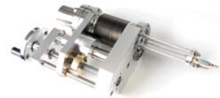
ULTRA HIGH VACUUM